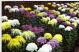
Chrysanthemum cvs. / Chrysanthemum