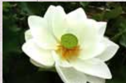
Nelumbo nucifera cvs. / Lotus