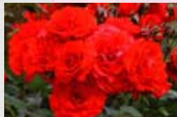
Rosa cvs. / Rose