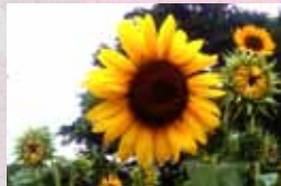
Helianthus annuus / Sunflower