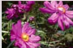
Anemone hupehensis var. japonica