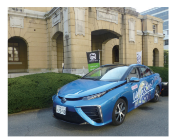
MIRAI, a fuel cell vehicle that runs on hydrogen

-To be 25% by Fiscal Year 2030. Recorded as 11.7% in Fiscal Year 2020.