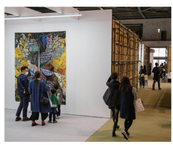
Art Collaboration Kyoto