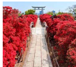
Nagaoka Tenmangu Shrine