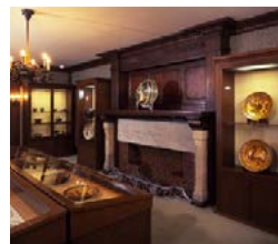
Asahi Group Oyamazaki Sanso Museum of Art