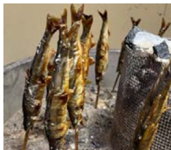
Grilled Ayu Skewers