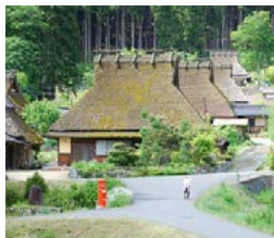
Kayabuki no Sato