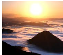
Oe-yama Sea of Clouds