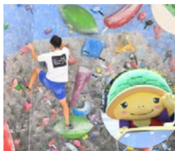
Bouldering at Sanga Stadium Kamemaru